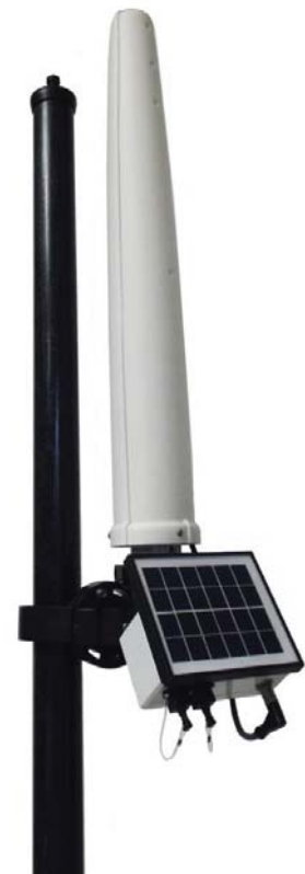
Area Monitor AMB-8059/03 with Solar Panel